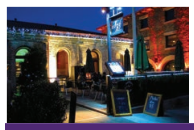
Conference Theme: Remarkable Women